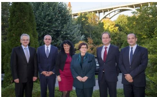
Meeting of Central European Ministers of Justice

The traditional meeting of V4 Ministers of Justice was expanded to the Meeting of Central European Ministers of Justice in May 2011, when the participants decided that the traditional annual event would take place every half year and Croatia and Slovenia would be included in the cooperation as well. The Meeting of Central European Ministers of Justice under the Hungarian V4 Presidency was organised in Veszprém, 7 October 2013. Partners agreed to coordinate positions concerning European insolvency proceedings, the European prosecutor and the EU justice scoreboard.