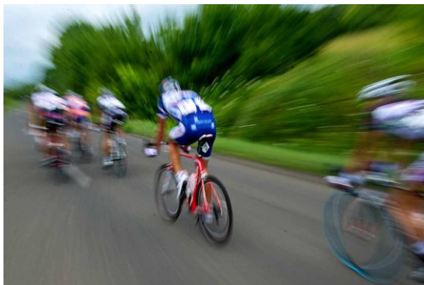
Visegrad 4 Bicycle Race

Sports also promote international understanding. The Hungarian Presidency continued with the initiative of the Polish Presidency, and organised the Visegrad Bicycle Race 13-18 May 2014, the home stretch being, naturally, by the hills of Visegrád. The four national bicycle associations were active in the organisation of this official race, open to both professional and amateur cyclists, supported by the International Visegrad Fund.