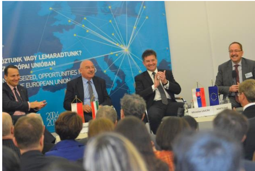
International Conference in Budapest Marking the 10 th Anniversary of the EU Enlargement of 2004

As 2014 marked the 10 th anniversary of the 2004 EU enlargement round, Budapest hosted a special seminar on 28-30 April 2014 to deliberate and reflect on the achievements and experience of the European accession and the ten years that followed. The panel-discussions of both Visegrad policy-makers of 2004 and incumbent V4 Foreign Ministers attracted strong interest. Andrassy University of Budapest, the only university outside the German speaking area operating entirely in German, also organised a conference on 10-11 April 2014.