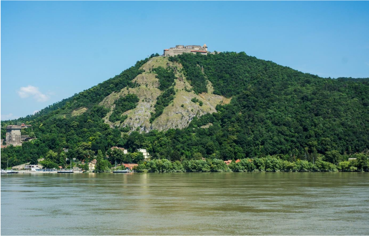
The Castle of Visegrád, Hungary