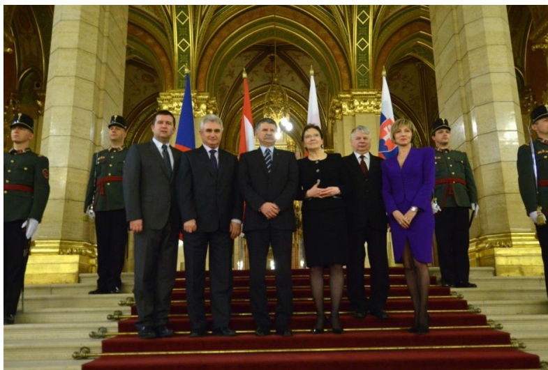
Meeting of the Speakers

Presidents of the four Parliaments' Foreign Affairs Committees at their meeting in Visegrád 30-31 January 2014 tabled an official proposal, which was finalised at the Meeting of V4 Speakers on 28 February 2014 in Budapest. According to the Speakers' agreement, prior to the annual meeting of the V4 Speakers of Parliaments, the Parliament of the incumbent V4 Presidency may call for a V4 Plenary Meeting, where the Speakers would be accompanied by a maximum of ten representatives of appropriate Parliamentary Committees covering the agenda items of the Speakers' Meeting.