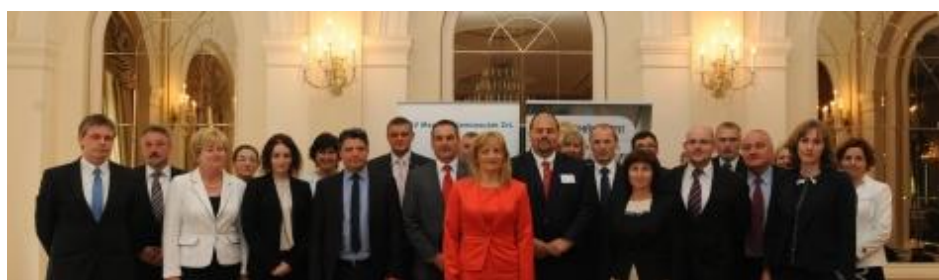
Executives of V4 railway companies

Under the Hungarian Presidency, high level representatives of the V4 ministries responsible for transport held several fruitful coordination meetings before the meetings of relevant EU bodies (Transport, Telecommunications and Energy Council) and reached common positions on issues such as the Fourth Railway Package or Single European Sky regulations. Furthermore, representatives of the V4 Aviation Authorities, as well as V4 experts on Combined Transport had meetings in Budapest. Heads of the four national railway companies also convened, agreeing on closer cooperation to improve the competitiveness and efficiency of the region's railway networks.