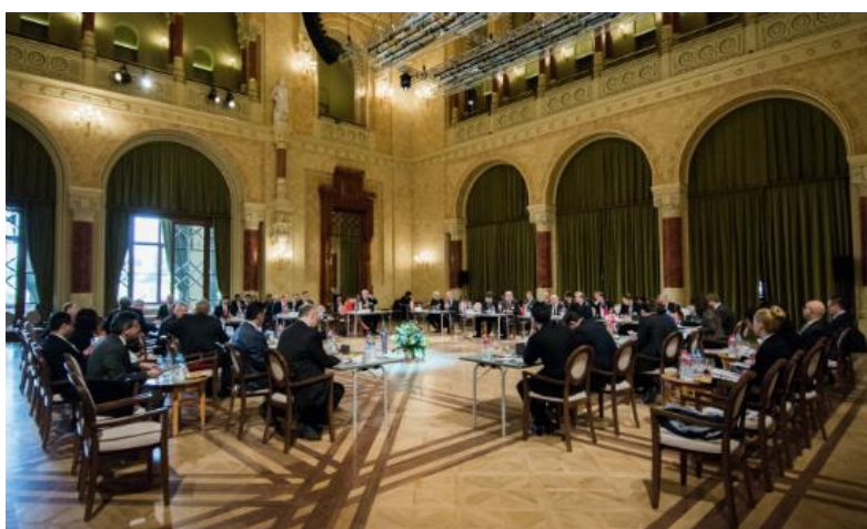
V4 – Eastern Partnership Ministerial Meeting

The Visegrad Group – Eastern Partnership informal foreign ministerial meeting was convened for the fifth time on 28-29 April 2014 in Budapest. The Ministers of Foreign Affairs of the Visegrad and Eastern Partnership countries, as well as the representatives of the EU Presidency, the Commission, the European External Action Service and the Nordic-Baltic countries discussed the future of the Eastern Partnership in light of the new challenges and mid-term tasks to be dealt with halfway between the Vilnius and Riga Summits. All speakers confirmed the validity of the Eastern Partnership policy, and stressed the commitment to implement the goals set in the Vilnius Declaration. They noted a substantial change in the geopolitical context of the realisation of these goals, and agreed in the need to adapt to the changed environment and to react jointly and effectively to the new challenges ahead. V4 Ministers stressed that a perspective of European integration, close political association and economic integration remain the best stimuli for deep reforms. The Ministers encouraged partner countries to make full use of the “more for more” principle, and expressed support to additional EU funding in support of reform efforts.