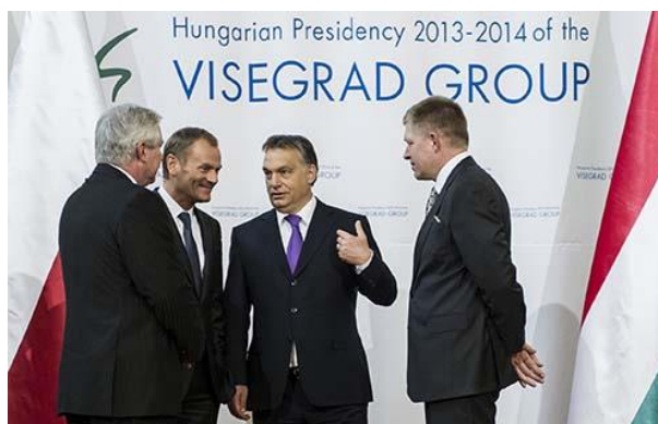
Visegrad Prime Ministers' Summit

At the Visegrad Prime Ministers' Summit of 14 October 2013, the heads of government agreed that European production of shale gas was desirable. V4 countries also support nuclear energy use and expect the EU to consider nuclear energy as one of the supported low carbon technologies, helping Central Europe increase its nuclear energy capacity. The V4 Prime Ministers agreed that every country had the right to define its own energy-mix, produce energy from the most convenient sources available; and there should be no discrimination in the EU regarding nuclear energy.