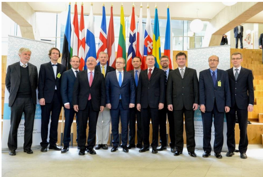
Foreign Ministers of V4, Nordic and Baltic Countries

Turning to the North, the Visegrad Cooperation is joining hands with the Nordic-Baltic-8 countries: Denmark, Estonia, Finland, Iceland, Latvia, Lithuania, Norway and Sweden. Hungary co-chaired the second V4+NB8 foreign ministerial meeting organised in Narva, Estonia on 6-7 March 2014. The Hungarian Presidency aimed for useful Visegrad–Nordic-Baltic cooperation also on the expert level: Budapest hosted the first meeting of Security Policy Director Generals on 21 January 2014, and the Hungarian Embassy in Stockholm organised an experts' seminar on fostering cooperation among regions of the EU's Baltic-Sea and Danube Region Macro-regional Strategies on 2 April 2014.